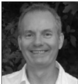
By Phillip Bennett, PhD

One of the most discussed topics in contemporary psychoanalysis is self-disclosure. With a new, post-modern understanding that psychoanalysis is never about just one person (the patient) but always about two persons—the patient and the analyst—the old myth that the analyst could stay completely hidden and anonymous in order to be a blank screen for the patient’s projection has given ways